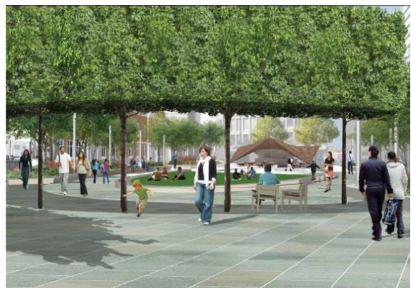
CGI of Aldgate Square/Portsoken Pavilion